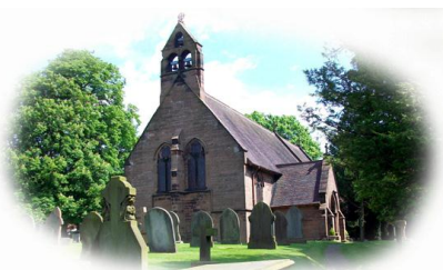
Christ Church, Crowton