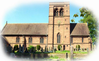
St. John, Norley