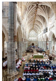
View from the nave during the service and awards