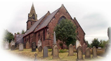
St. John, Kingsley